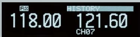
Operating information is clearly shown on the OLED display.

The IC-A220 has a bright organic light emitting diode (OLED) display with a very wide 170 degree viewing angle. White characters on a black background show clear easy to read operating information. With white key backlighting, the white OLED display matches modern plane's instrument panel. In addition, the auto dimmer function adjusts the display for optimum brightness at day or night.